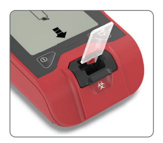
Place microcuvette into analyzer.