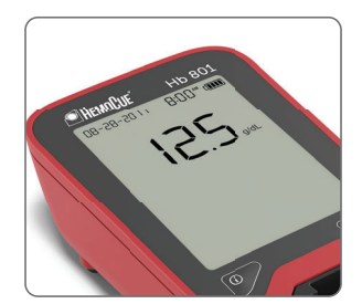
3 View results.

HemoCue AB | PO Box 1204 | SE-262 23 Ängelholm | Sweden Phone +46 77 570 02 10 | Fax +46 77 570 02 12 | info@hemocue.com | hemocue.com